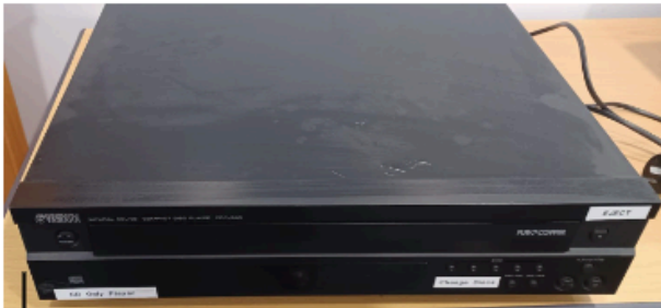
Yamaha 5 disc tray CD player Model CDC-585